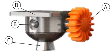
Closed and locked position. Example shows combination Quick Fit unit with 4 holes and Base Male.